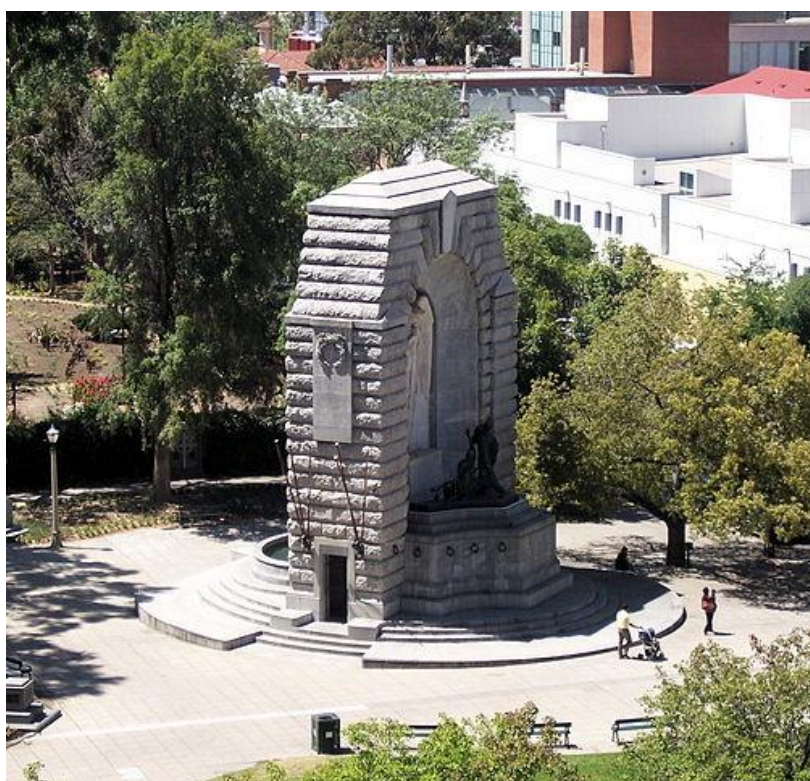
Adelaide War Memorial